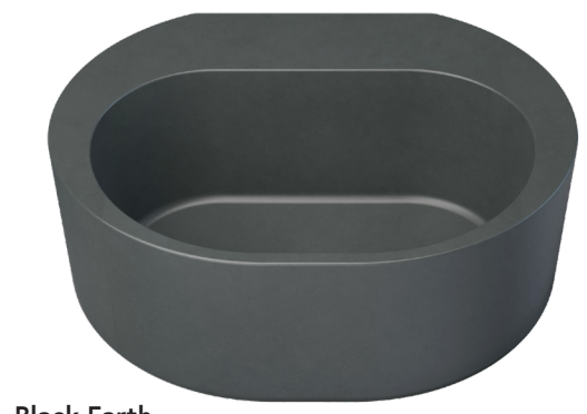
Dunstan - Black Earth QUDU11BE no taphole QUDU11ABE with taphole