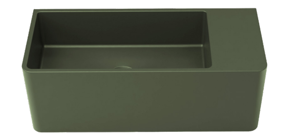
Tussock - Grey Green QUTU11GG no taphole QUTU11AGG with taphole

The Tussock basins are designed for easy installation, available in various finishes, and customisable for both deck and wall-mounted taps, ensuring seamless integration into any bathroom design.