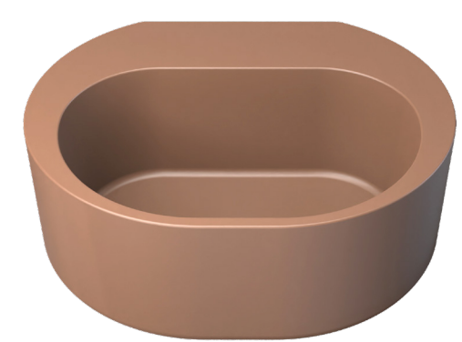
Dunstan - Tan QUDU11OB no taphole QUDU11AOB with taphole

The Dunstan collection is hard-wearing, designed for easy installation, and available in various finishes. Customisable for both deck and wall-mounted taps, these basins seamlessly integrate into any bathroom design.