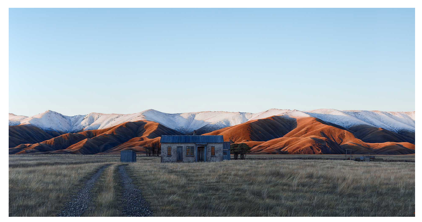
Credit: Falling Dusk at the Hawkduns 150 Painted by Michelle Bellamy https://www.bellamygallery.co.nz/