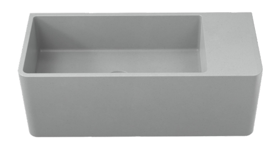
Tussock - Grey White QUTU13GW no taphole QUTU13AGW with taphole