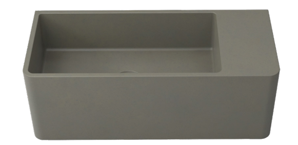
Tussock - Taupe Clay QUTU13TC no taphole QUTU13ATCwith taphole