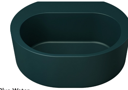
Dunstan - Blue Water QUDU11BW no taphole QUDU11ABW with taphole